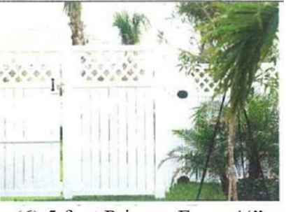
(6) 5 foot Privacy Fence 1/2" space between Panels w/ Lattice Top & Gothic Caps